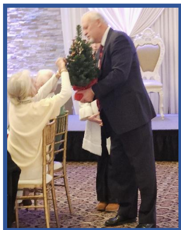
The Salon Zucker candies were also given to members attending the Christmas Party who fled Liebling 80 years ago.