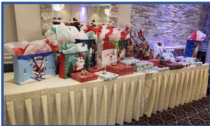
Die Kinder Gifts – 32 members' children received gifts from Santa Claus

(Christmas songs were sung between the Children's Performances at the Party)