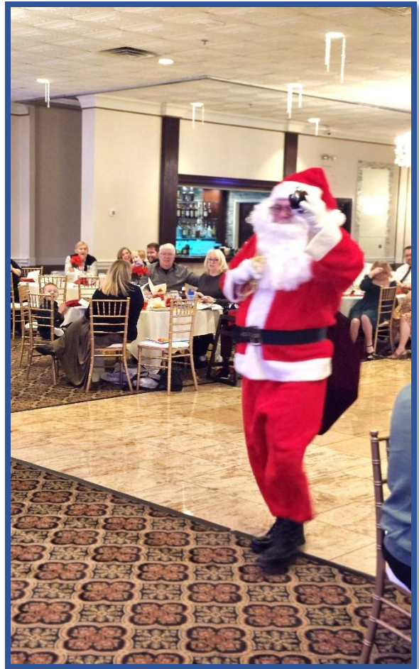
Here Comes Santa Claus!!!