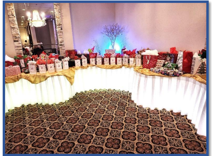
Members brought beautifully wrapped Raffle Gifts!