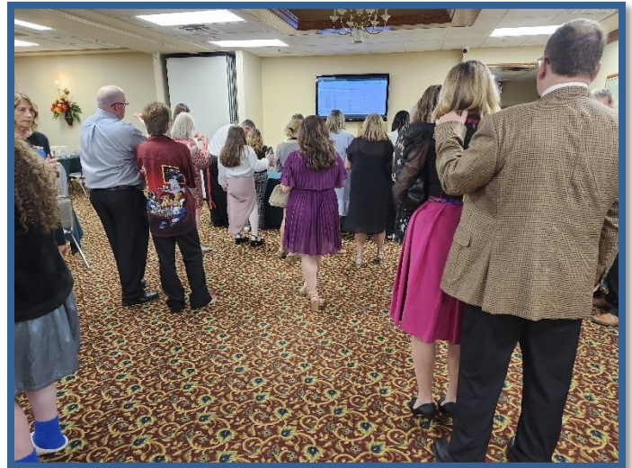
Members and Guests enjoying the food and dessert: