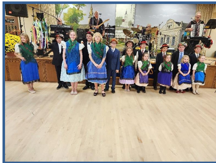
Our Kleine Kinder Marchers