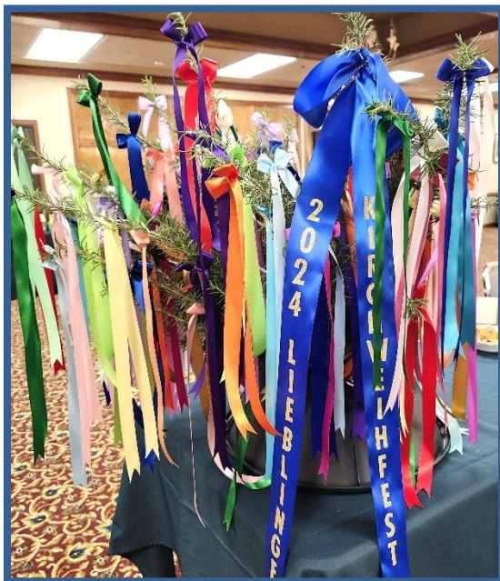
Lieblinger Kirchweih 2024 Strauss