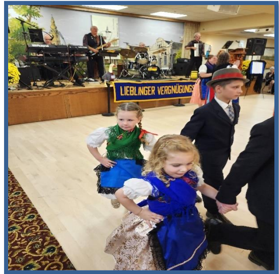
Performing the Stoltztanz