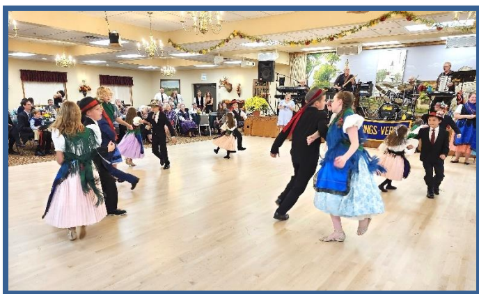
and the Chicken Dance