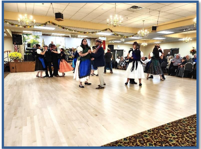
"Schön ist die Jugendzeit"